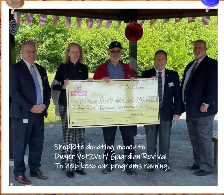
ShopRite donating money to Dwyer Vet2Vet/ Guardian Revival To help keep our programs running.