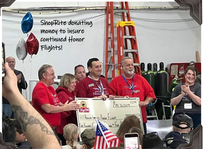
ShopRite donating money to insure continued Honor Flights!