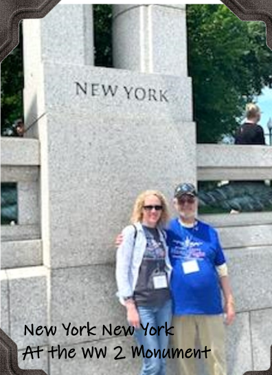
New York New York At the WW 2 Monument