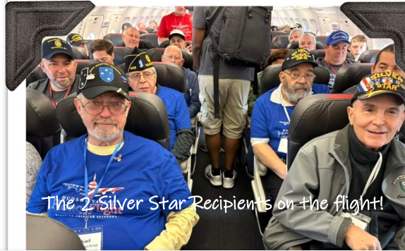
The 2 Silver Star Recipients on the flight!