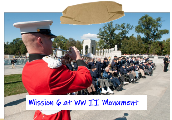
Mission 6 at WW II Monument