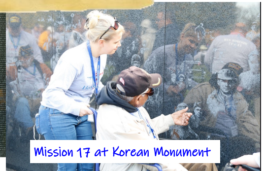
Mission 17 at Korean Monument