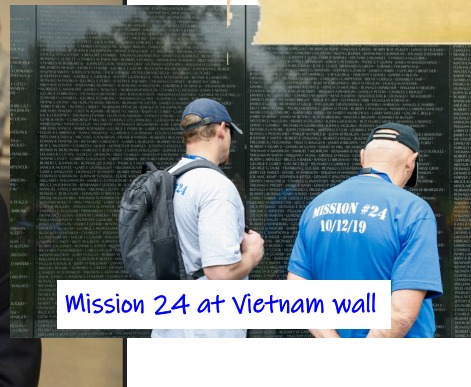
Mission 24 at Vietnam wall