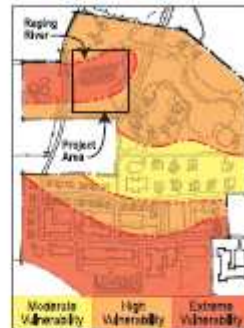
Town of Hazardville Composite Loss Map developed previously during risk assessment (see FEMA 386-2).

Losses avoided by acquisition and demolition of flood-prone structures