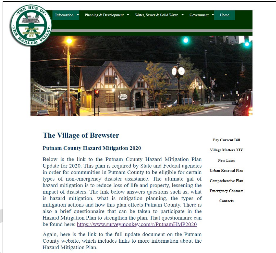
Figure 3-2. Village of Brewster, NY Website