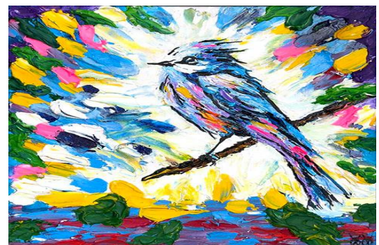
John Bramblitt- Blind artist

Where: Studio Around the Corner 67 Main Street Suite 101 Brewster, NY 10509