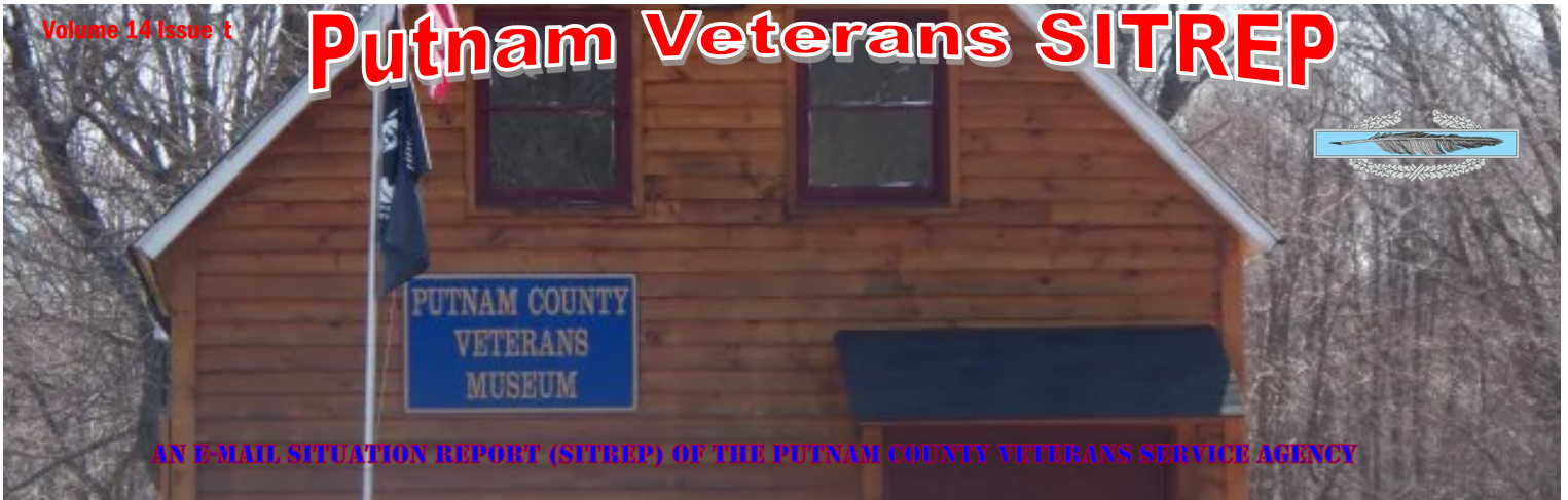
AN E-MAIL SITUATION REPORT (SITREP) OF THE PUTNAM COUNTY VETERANS SERVICE AGENCY

This is a real short issue of the Sitrep!